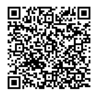
Or view our pricelist (at the showroom entrance)